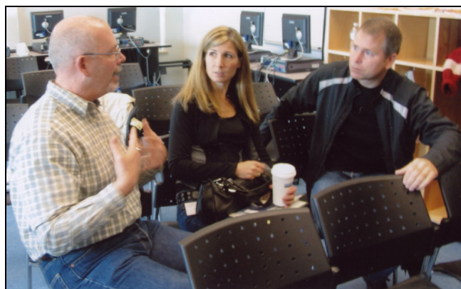
Family Weekend 2005